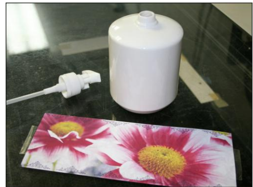
Supplies needed: Adjustable Wrap, sublimation transfer, heat tape, soap dispenser.

Failure to follow these instructions could cause product failure and void any product warranty.